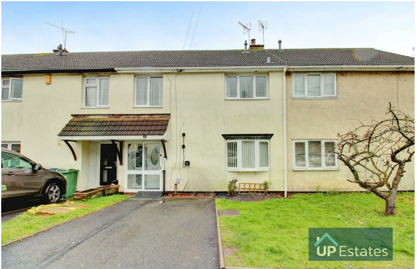
St. Catherines Close, Coventry